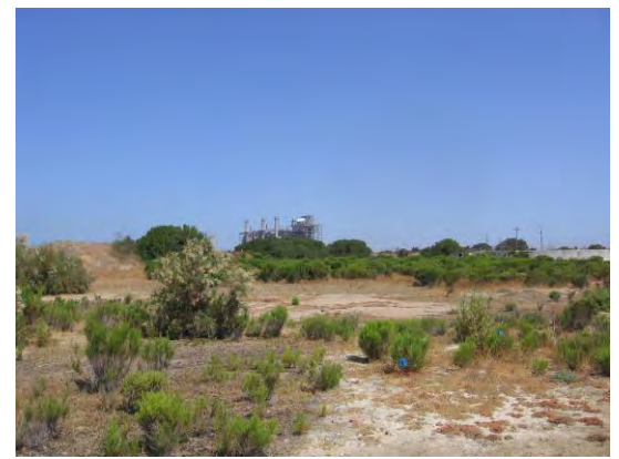
Photo 1 : On-site view of the proposed Bay Boulevard property looking north