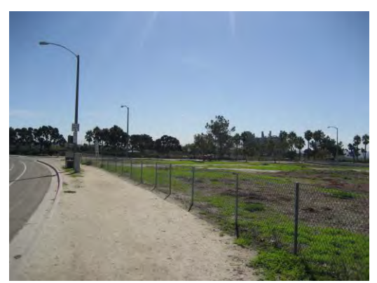
Photo 7: View southeast from Marina Parkway northwest of Marina View Park toward SBPP