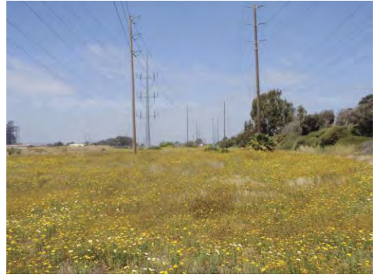
Photo 3: View of the ROW east of the proposed Bay Boulevard Substation, looking north