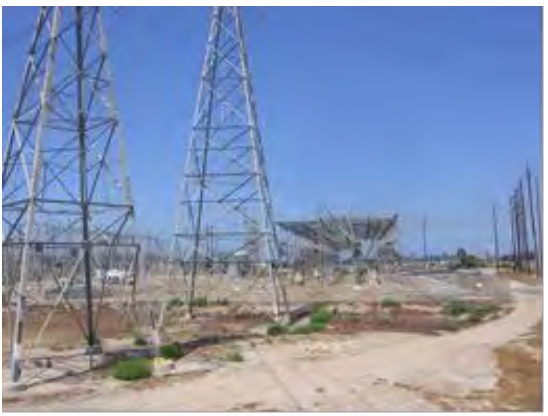
Photo 2: Looking west at the South Bay Substation (to be dismantled)